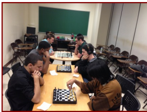
NYSCAS students concentrate in an early chess tournament round.

Just in time for fall finals, Health and Recreation Club gave students a new strategy to combat stress. The club held its first chess tournament at the Midtown campus on December 19th in Room 314. While many students signed up, only eight students found enough downtime to enter the double-elimination competition.